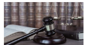
Law Enforcement and Criminal Justice