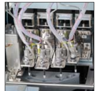
4 Wash Probes