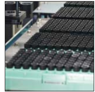
576 Pipette Tips