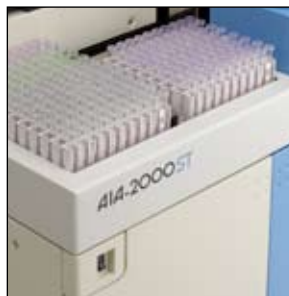
200 Sample Loader